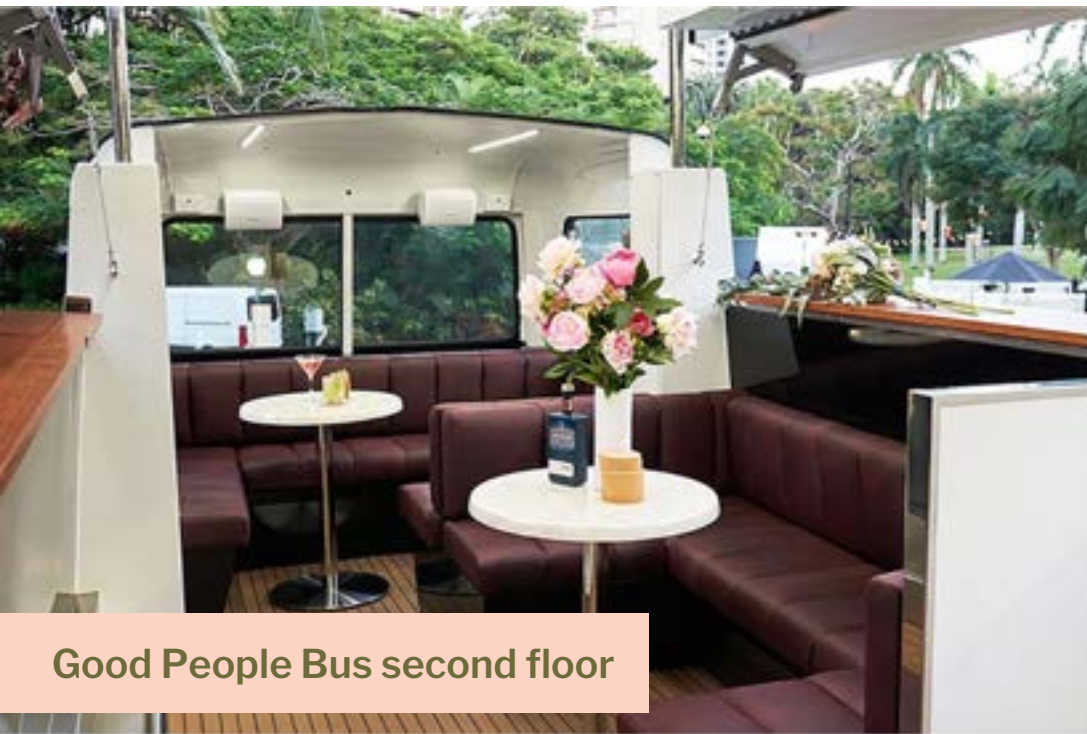
Good People Bus second floor